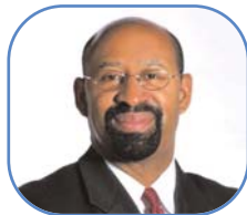
Mayor Michael A. Nutter