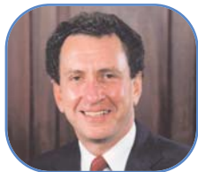
Senator Arlen Specter