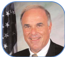
Governor Edward G. Rendell